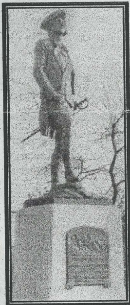
Col. Washington Statue, 1930

The Braddock Expedition lost a $25,000 payroll in gold coins in the defeat and hasty retreat. No full explanation of what happened to the gold was ever made. There are rumors that the gold may still be buried somewhere in southwestern Pennsylvania. The Carnegie Museum at Braddock has a nice exhibit of artifacts of the battle.